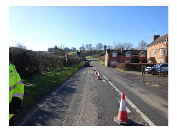
Figure 10. Route Configuration

This installation involved overblowing a cable in a subducted route alongside a minor road. The total length was approximately 550m. In view of this it was decided to attempt a centre-blow involving 250m and 300m installations. This route included a 1 in 10 climb up a hill.