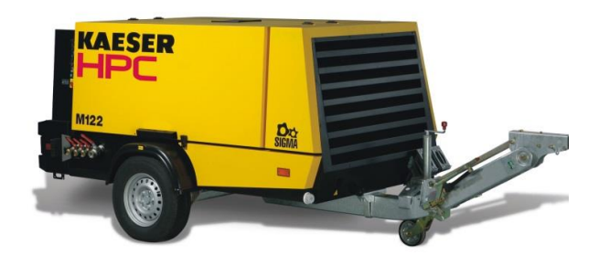
Figure 5. Compressor

could be applied to the cable. The level achieved during this test was lower than that achieved when undertaken in 8mm bore mini-duct, this is due to the amount of space in the sub-duct for the cable to buckle and get deformed.