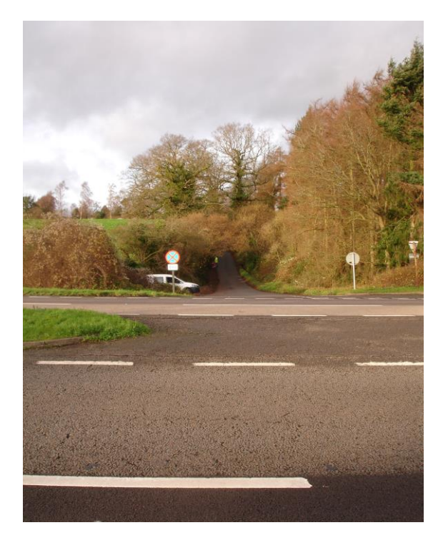
Figure 8. A.40 Road Crossing

The first trial was conducted at a road crossing under a major dual-carriageway between Monmouth and Ross-On-Wye in the Wales/England border region. The key factors for this installation were that conventional installation practices would have involved major traffic management and subsequent disruption and civils costs. Upon arrival on-site the entire installation, approximately 100m, took less than one hour and was completed without any issues and minimal disruption. The only traffic management that was required was for one lane in the roadway to be coned off in order to provide a safe working area. It can be assumed that the cost savings to the customer were in the order of £50k.