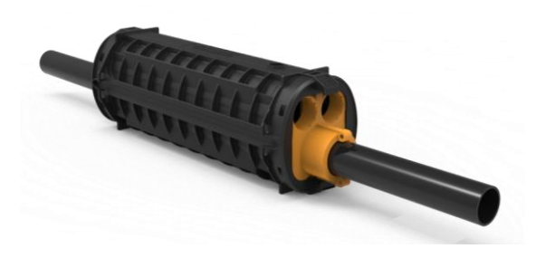
Figure 11. Overblow Closure

Once installed it is important to protect the mini-cable from damage in man-holes, particularly when the centreblowing installation process has been used. In order to achieve this a new closure has been developed which accommodates all the sub-duct sizes that the customer uses and allows up to two overblown cables to be dropped off into an alternative optical fibre joint. This closure is designed to be suitable for retro-fit and is rated to IP68. As with all blown system joints a pressure relief valve is fitted for safety to protect against over pressurisation.