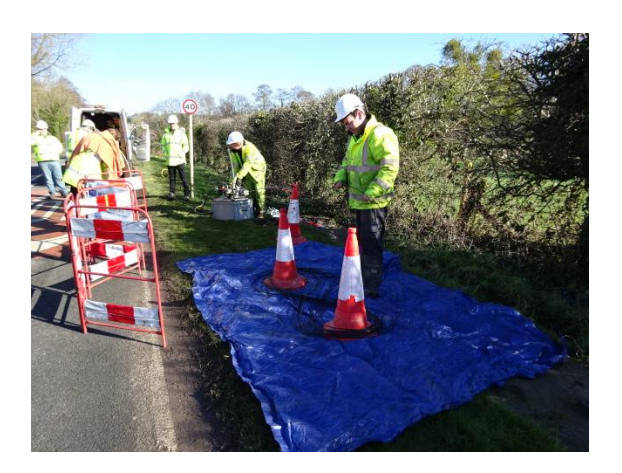
Figure 11. Cable Fleeting For Centre Blowing

Upon arrival on-site the entire installation took less than three hours and was completed without any issues. Once again the disruption to third parties was kept to a minimum. It can be assumed that the cost savings to the customer were in the order of \pounds 25k .