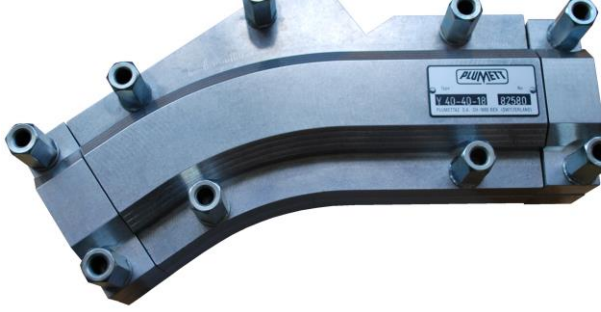
Figure 6. Typical Overblowing Heads

In order to maximize the push force that can be applied to the mini-cable it is important that the link between the