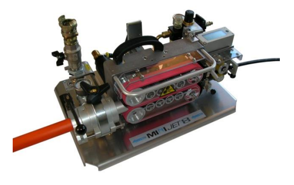
Figure 4. Cable Blowing Machine

The cable blowing machine must be suitable for this new design of mini-cables and should have the ability to limit the level of push force that is applied to the cable so that in the event of the cable hitting an obstruction no damage would be inflicted on the cable. 'Crash Tests' were undertaken to determine the maximum push force that