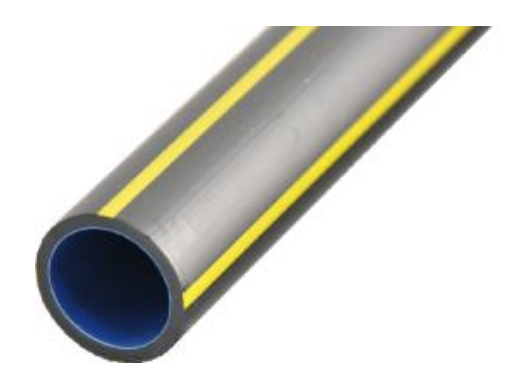
Figure 2. Sub-duct Design

The high density polyethylene sub-duct that the customer installed is shown above. The key parameters are detailed in table 2.