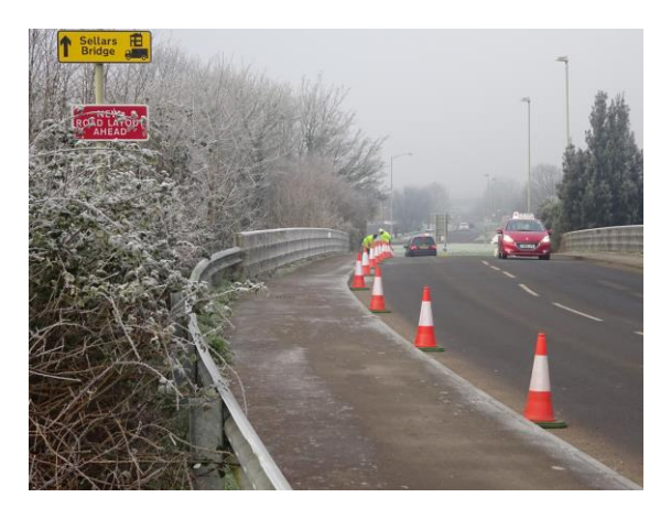
Figure 9. Bridge Crossing

Once again upon arrival on-site the entire installation, approximately 100m, took less than one hour and was completed without any issues. As can be seen from figure 9 the third party disruption was minimal and only for a limited time. It can be assumed that the cost savings to the customer were in the order of \pounds 35k.