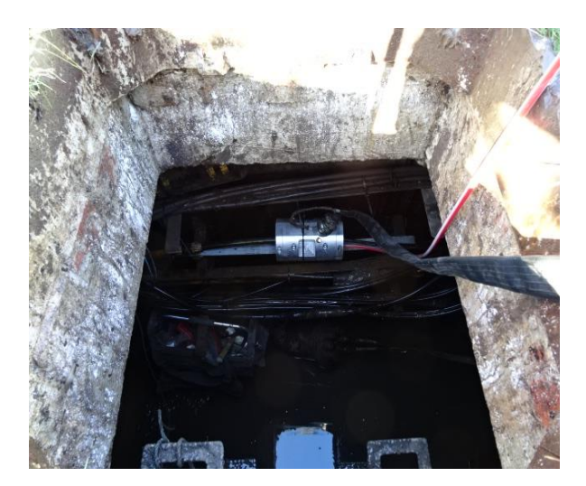
Figure 7. Overblowing Head Management