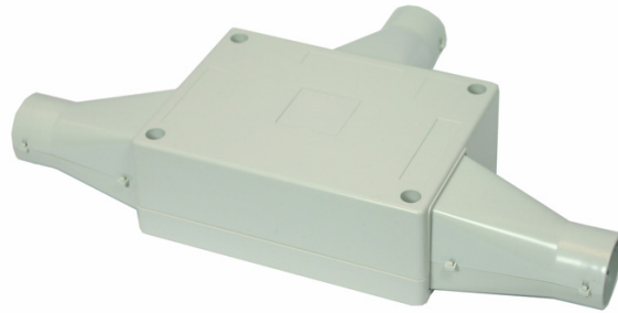
Internal TDU (Plastic Construction)

The Internal Tube Distribution Units (TDU's) are used as a 3 or 4 way distribution point for tube management for vertical / horizontal connections of blown fibre tube cables. The TDU's allow the interception of a Blown Fibre Cable to be connected to spur off cables for distribution within the internal environment.